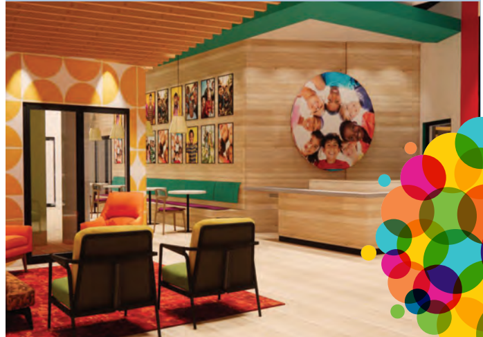
Architect's rendering of the welcome desk at the CFCL Frogtown-Rondo.