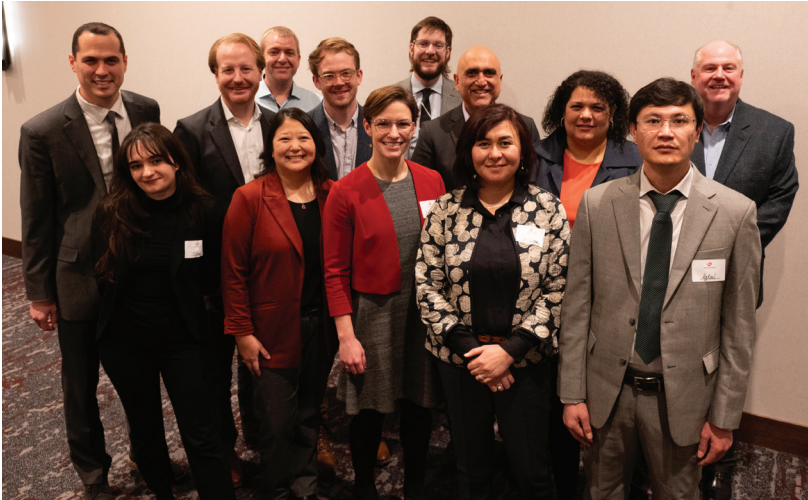
LSS leaders celebrate with the finalists of the Design Lab's inaugural Incubator cycle.