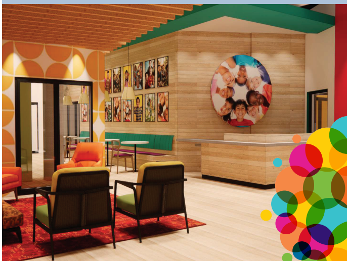
Architect's rendering of the welcome desk at the CFCL Frogtown-Rondo.